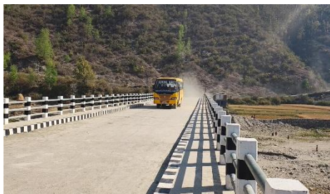
A School bus carrying children crossing the Sharada River via bridge

Even the Khairabang temple, cherished for its historical and spiritual significance, experienced a decline in devotees during the rainy season, as the challenging journey discouraged many from making the trip.