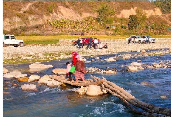
A mother carrying one child on her back and helping another to cross the Sharada River

The Sharada River, with its banks adorned by lush paddy fields, brings life to the Salyan district. While it has always been essential for the region, its story is one of stark contrasts. In Triveni Rural Municipality, Kavra Ram Bazaar Ward No. 1 enjoys a thriving market, a well-equipped health post, and a high school - privileges that Ward No. 2 and the neighboring villages lack. Residents of Ward No. 2 and the surrounding areas have traditionally relied on their neighboring ward for access to these essential facilities. However, the river remained a significant obstacle, especially during the monsoon months. For those living across Kavra Ram Bazaar, it transformed that same river into a force of isolation.